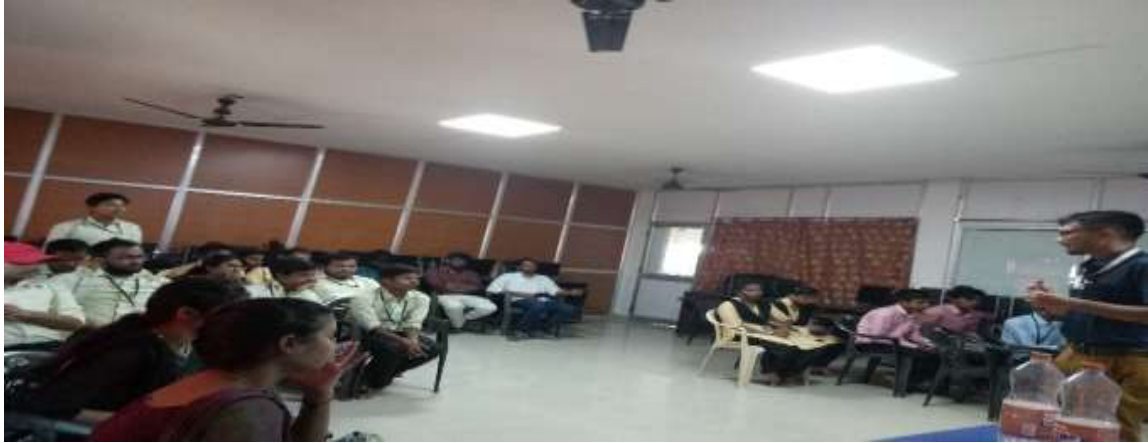
Figure 1: 22.11.2018, CIVIL_GATE Coaching