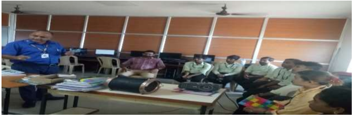
Figure 7: 29.12.2017, CIVIL_GATE Coaching