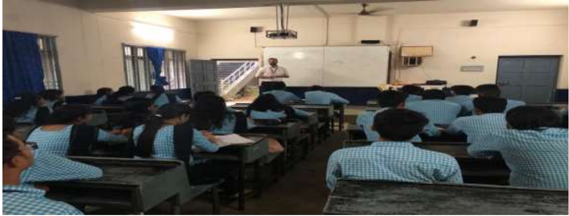
Figure 3: 20.11.2017, Mathematics_NET_GATE