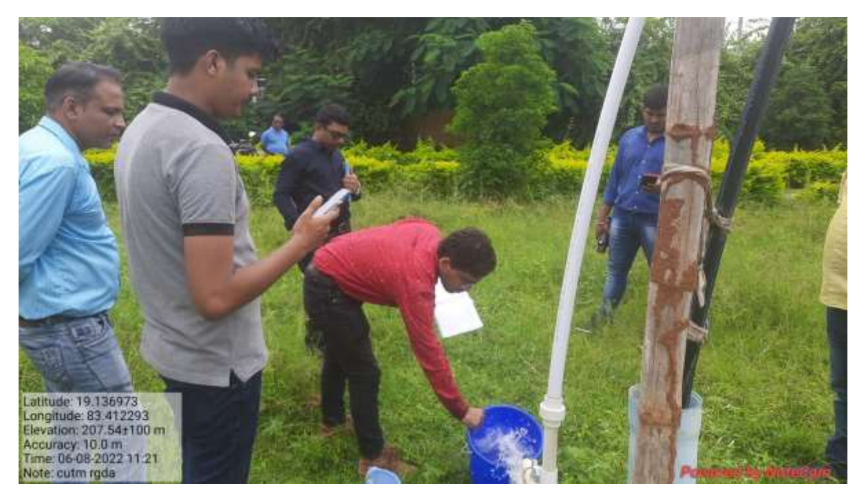
Figure: 1.3 - Verification of quantity of water yielded from each water source