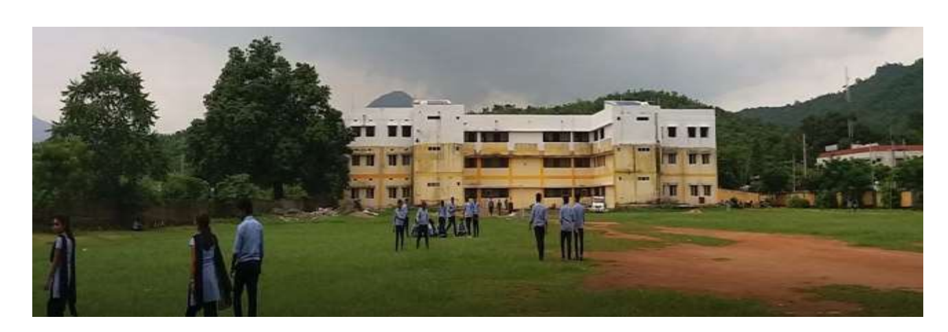
CONSULTATION and REPORT by