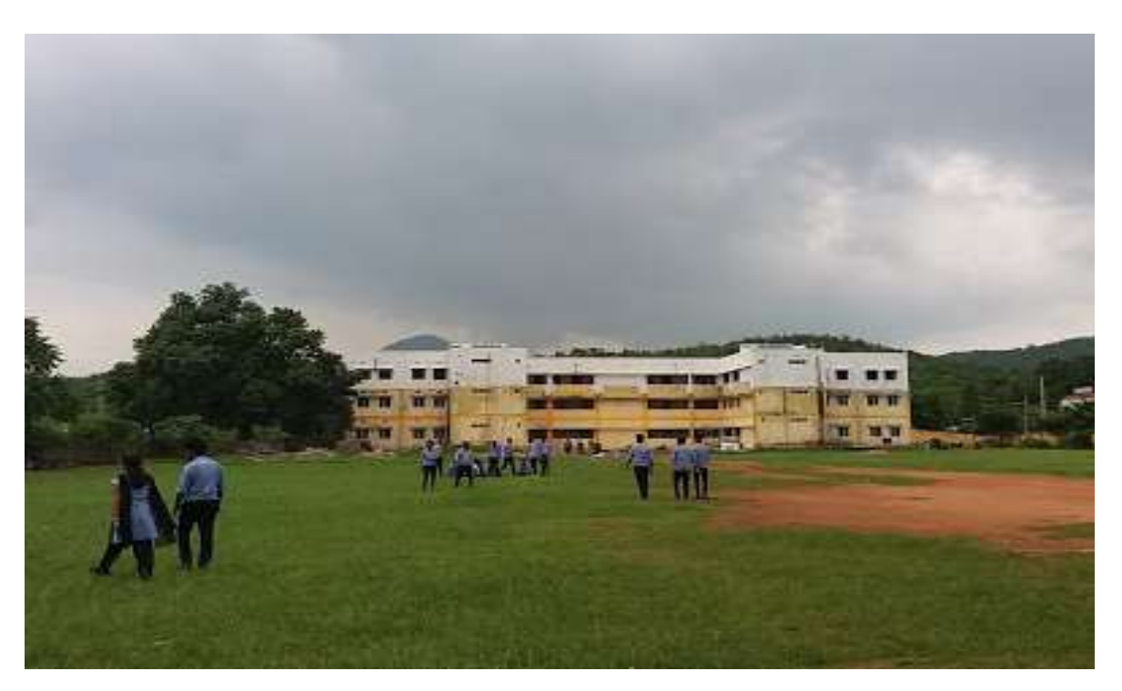
Figure: 1.2 - Image of Centurion University, Rayagada Campus