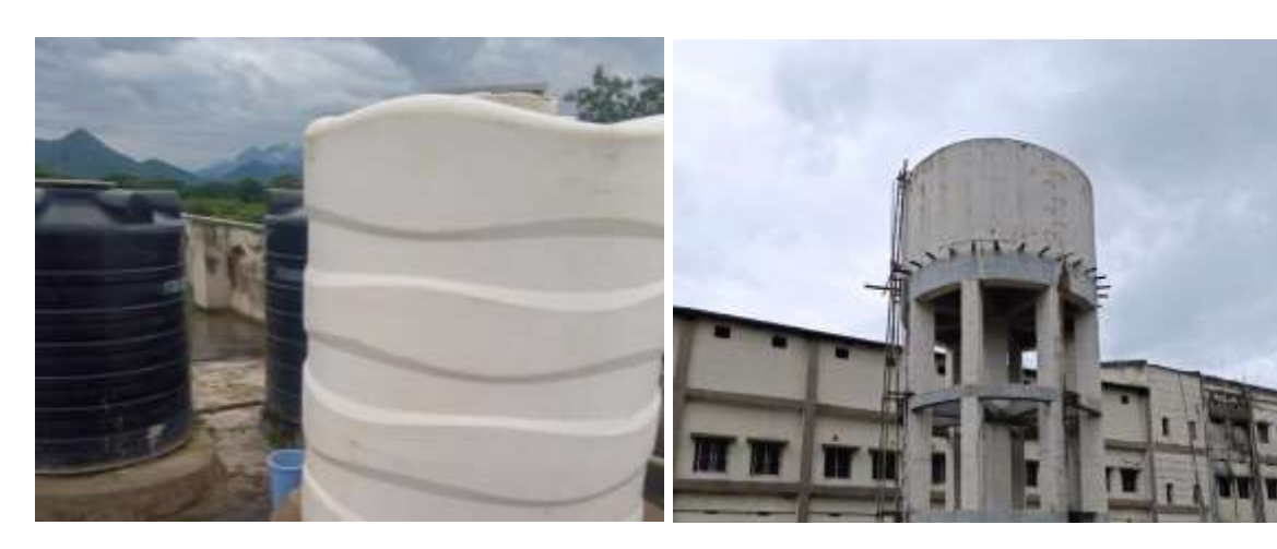
Figure: 1.4- Image of Overhead Tank