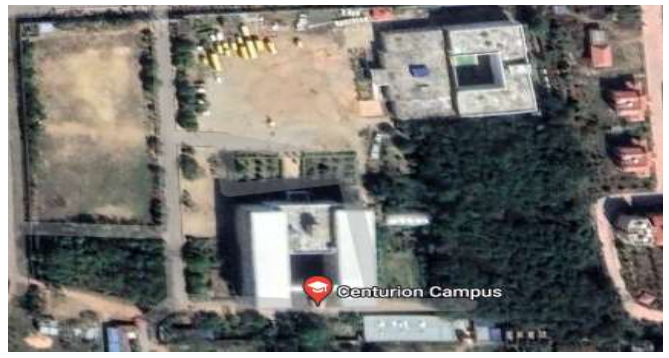
Figure: 1.1 - Image of Centurion University, Balangir Campus from Google map.

Their vision was to build Centurion University brick by brick not only as a home for research and education but as an institution which provides opportunities for growth to all students from across the social canvas and they have succeeded in consolidating Centurion University as a truly remarkable place, with expertise across a wide range of disciplines and a superb academic atmosphere.