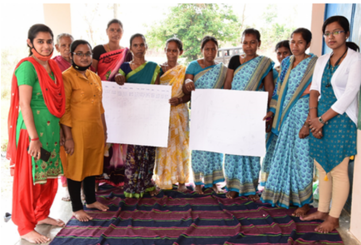
Gender Sensitization at Barlanda