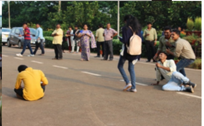
Flash-Mob & Street Play Women Empowerment