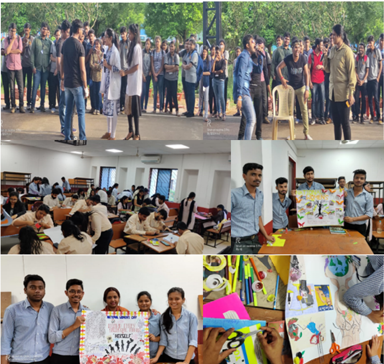
Poster Competition on the Eve of Women's Day