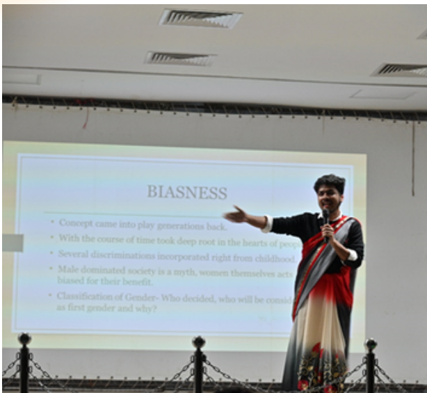
Understanding Gender biasness