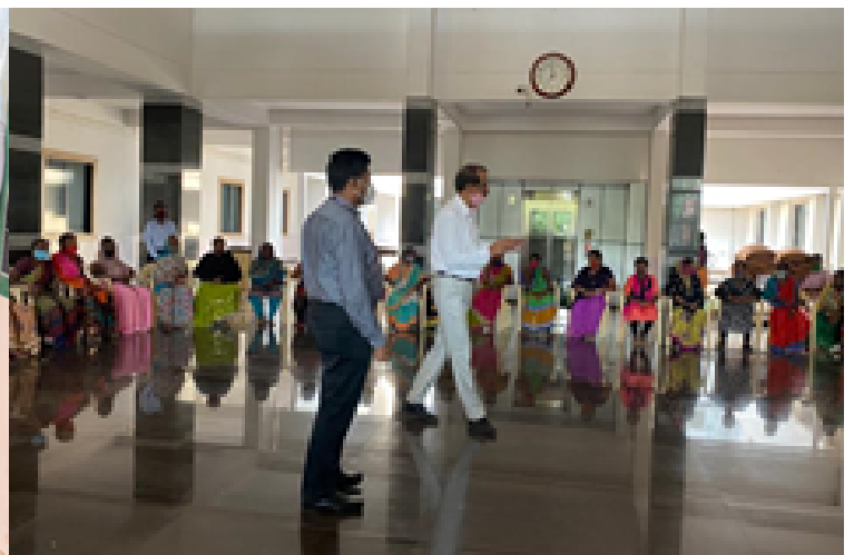
International Women's Day Celebrations on the theme "Women in Leadership: Achieving an Equal Future in a COVID-19 World".