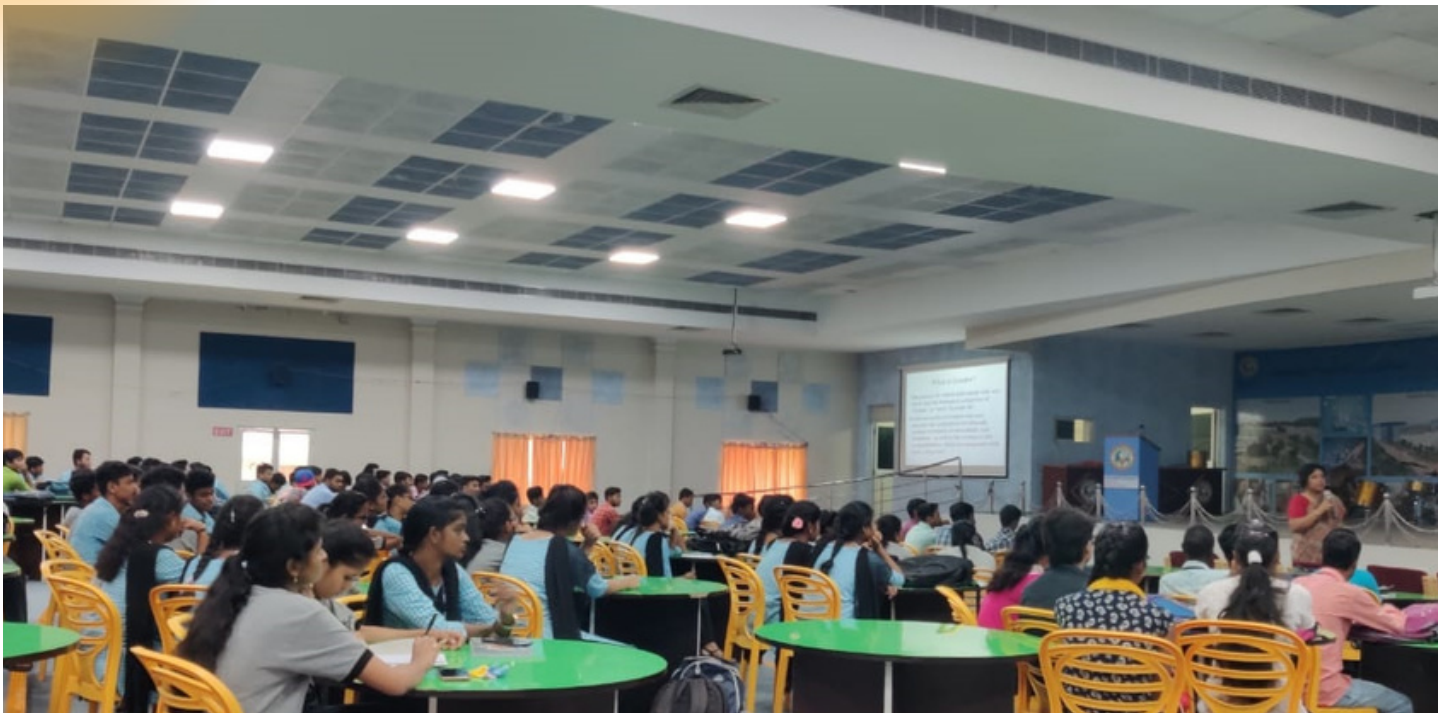
Centurions for a Social Cause: State Level Event on “Declining Child Sex Ratio and Dignity of Girl Child