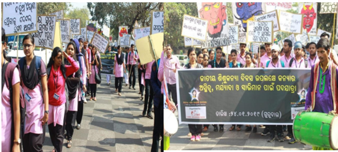
Awareness rally, meeting, poster presentation and signature campaign organised on 24th of January, 2019 on the occasion of National Girl Child Day