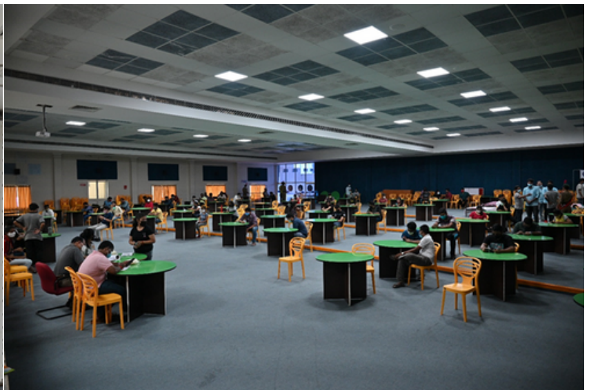
Workshop on Dimensions of Gender Discrimination