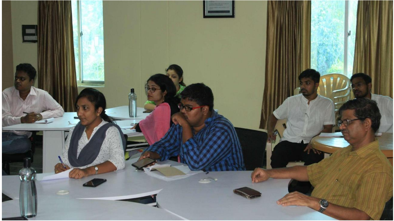
Figure: Participants attending the FDP on Induction programme