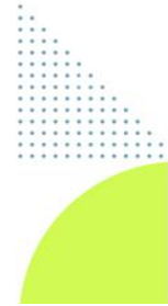
Figure: Brochure of the Faculty Development Programme