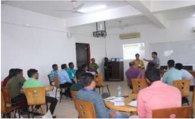
Figure: Participants during the workshop