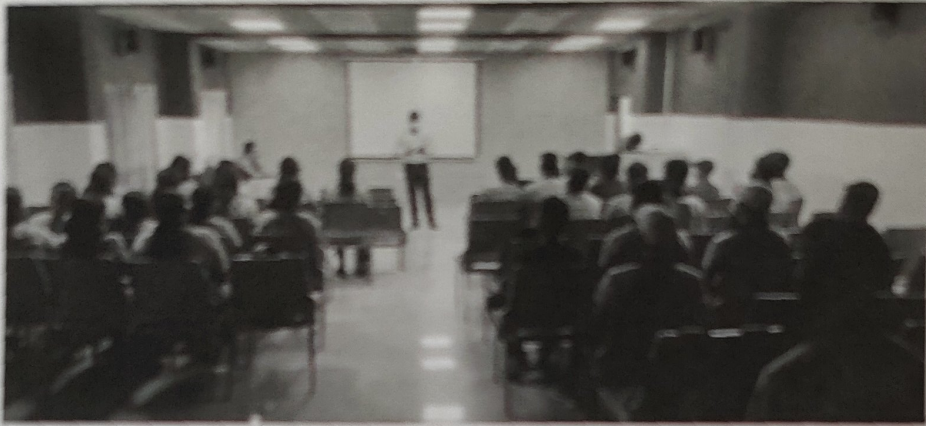
Figure DISCIPLS_ Expert Talk-5