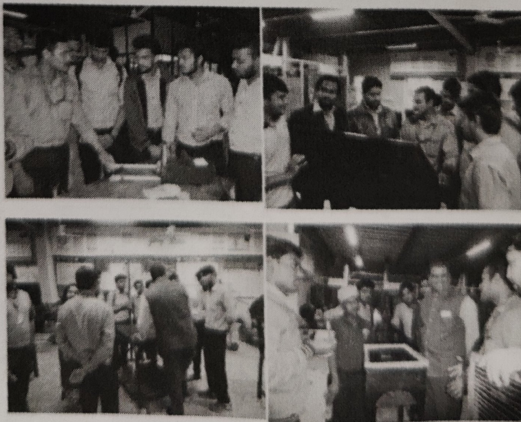
Figure 19 Mechanical_Domain

It provides in-depth technical training & knowledge of manufacturing, welding & Automobile which would strengthen knowledge, competency, product development and industrial-institutional partnership.