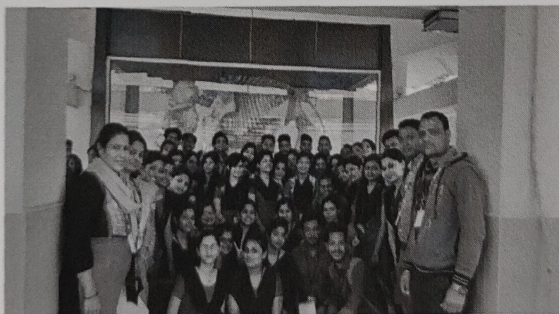
Figure 11 Zoology_Alumni Talk

Joined centurion to complete our masters but we all left as a skilled and groomed career-oriented personals having a large exposure about continuing our career in the field of academics as well as research. We are thanking to CUTM for providing us such an good opportunity.