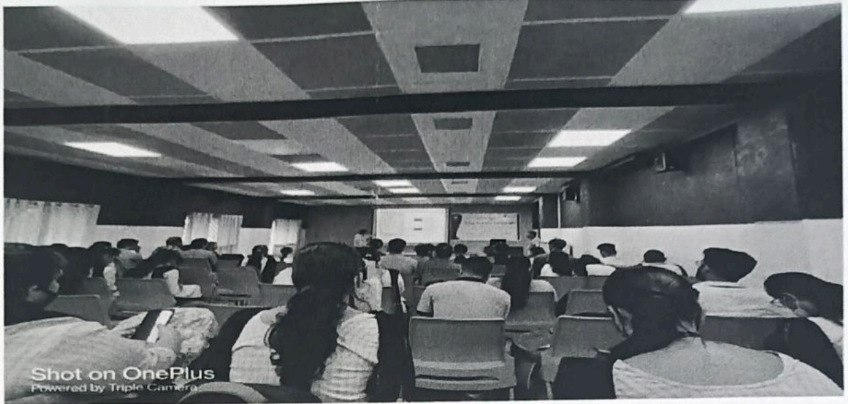
Figure 1 Botany_Gate Coaching