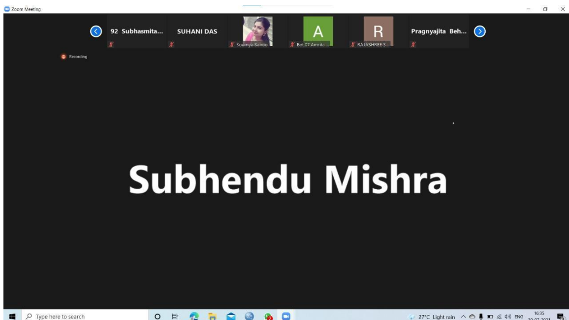
Screenshot of the online webinar on Medical diagnosis & preventive healthcare in India