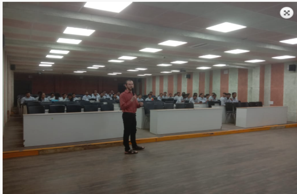
Figure: Clip from the workshop on Achieving at University - SoM