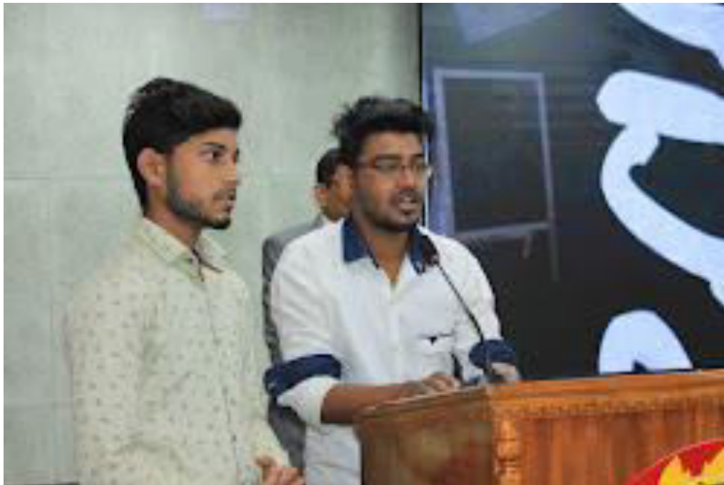
Workshop Demonstration on Solar Thermal Engineering