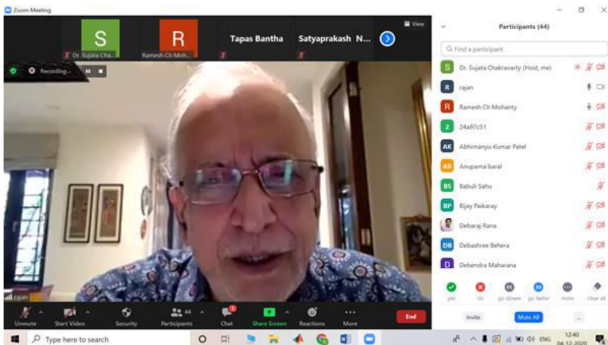
Screenshots of the on-going online FDP